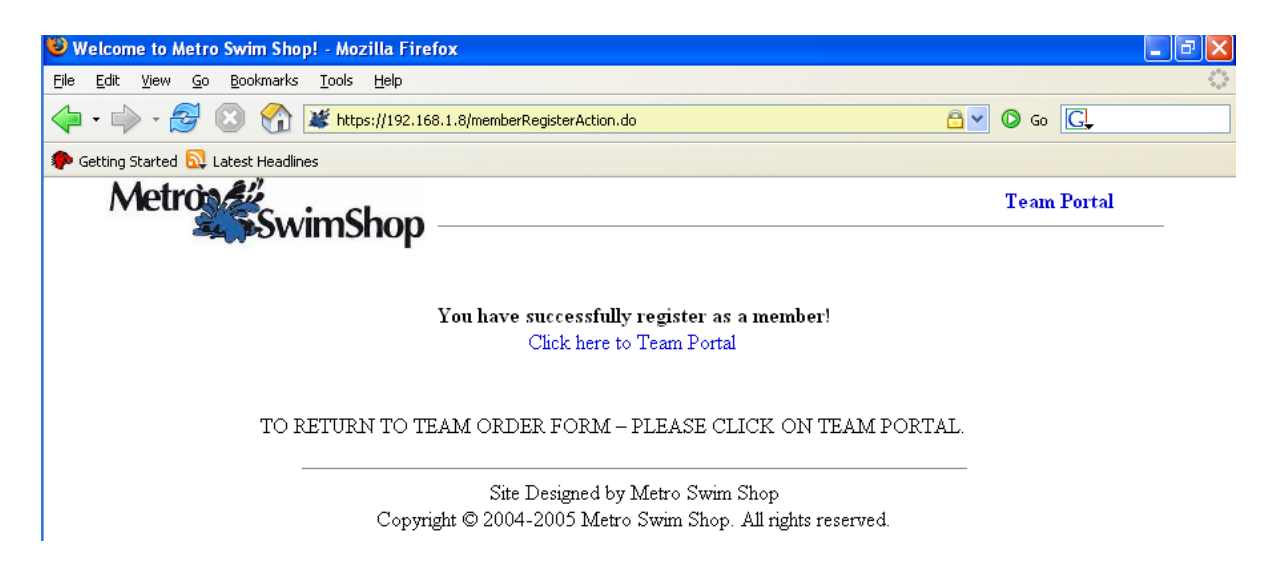
Step 4. Click on "Click here to Team Portal" and you will be led to the portal login page.

Then, you will see the following message: